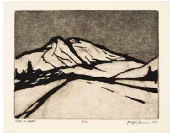
Road to Banff Joseph Therrien 1979 ed. 2/20 Drypoint on paper 2008.2.9

Cover artwork Atomic Fountain (detail) B.C. Binning 1950/1994 Screenprint 2008.7.23