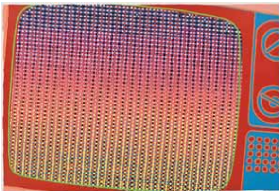
No title Michael de Courcy 1984 ed. 1/40 Screenprint on paper 2008.2.5