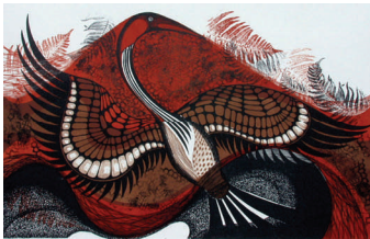
Pnina Granirer Loon Lithograph 37cm x 56cm

General information about the artists is below. Detailed information about the artists and their work is included in the box. Original artworks (shown) are from the City of Burnaby Art Education Collection and reproductions included are from the City of Burnaby Permanent Art Collection.