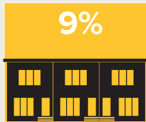
Row / Townhouses