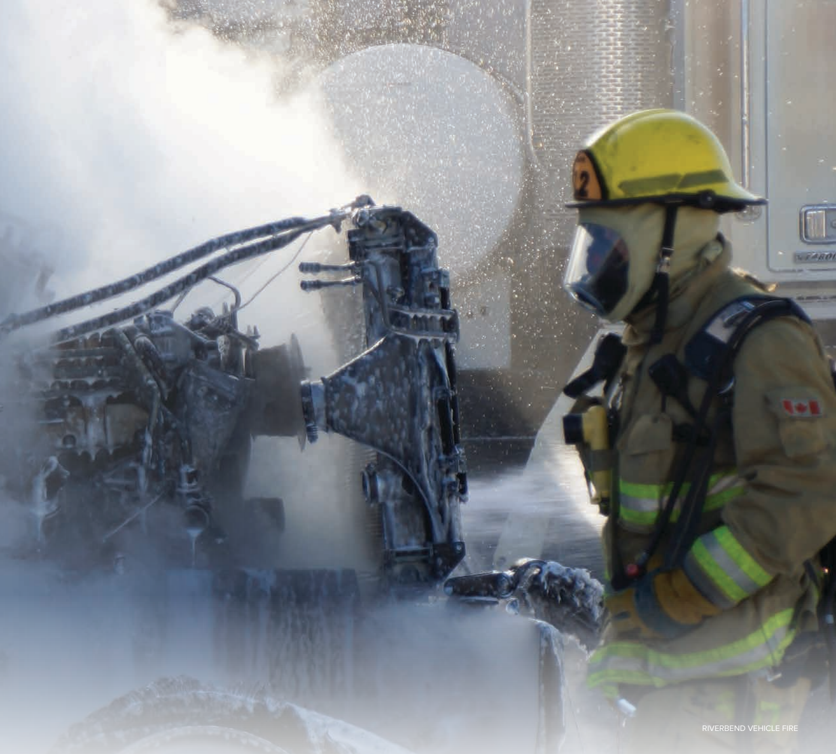
RIVERBEND VEHICLE FIRE