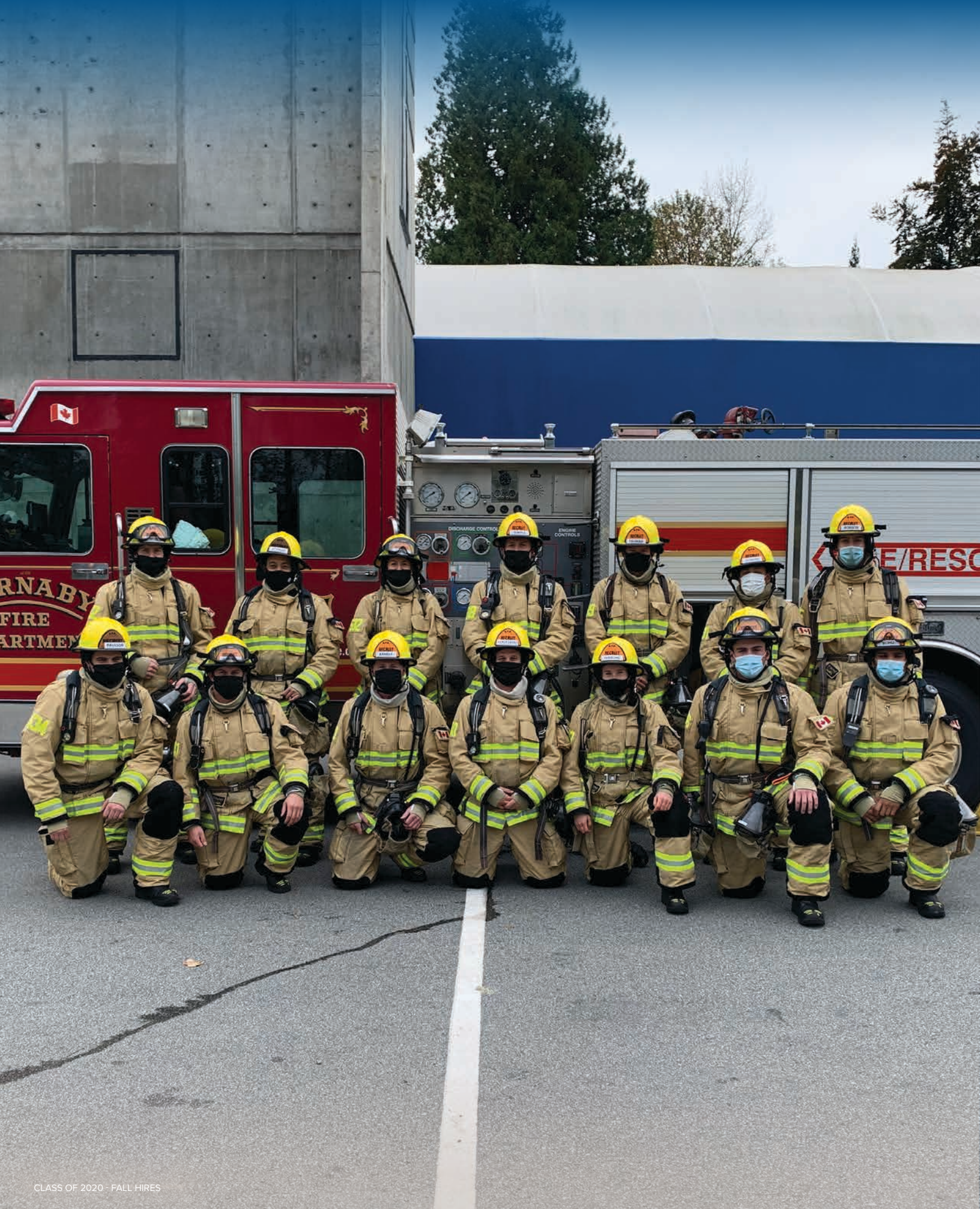
CLASS OF 2020 - FALL HIRES