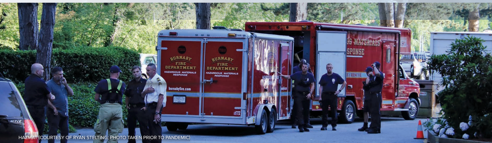
HAZMAT (PHOTO TAKEN PRIOR TO PANDEMIC)

NET EXPENDITURES $46,395,372 2020 POPULATION 253,430 (AS PROJECTED BY BC STATS) PER CAPITA COST $183