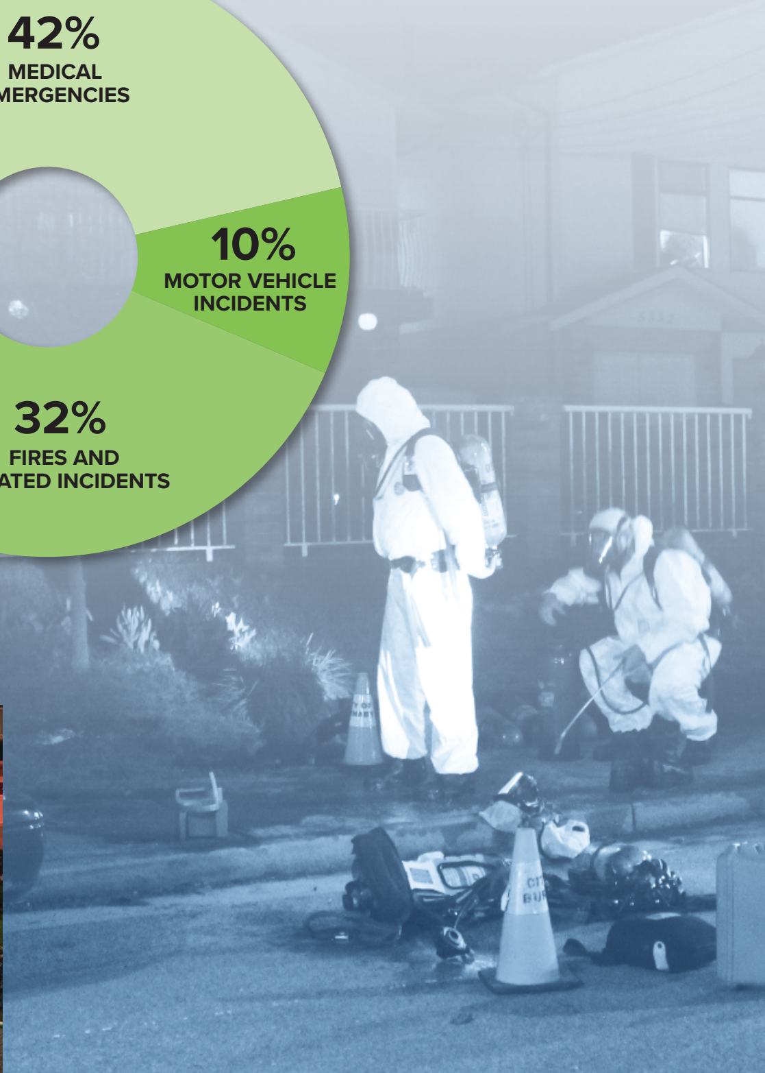
DECONTAMINATING AFTER A MEDICAL EMERGENCY