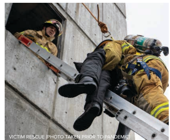
VICTIM RESCUE (PHOTO TAKEN PRIOR TO PANDEMIC)