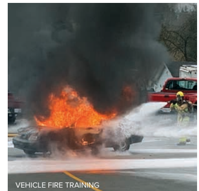
VEHICLE FIRE TRAINING