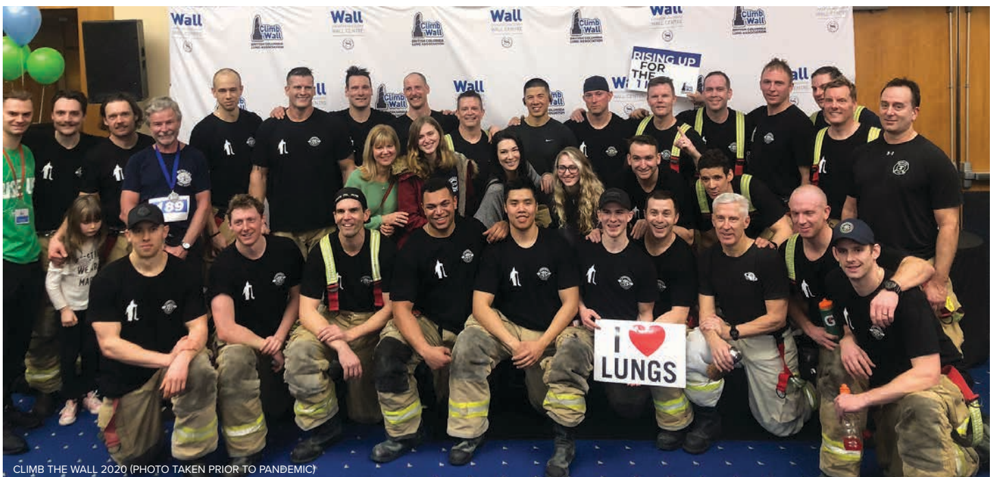
CLIMB THE WALL 2020 (PHOTO TAKEN PRIOR TO PANDEMIC)