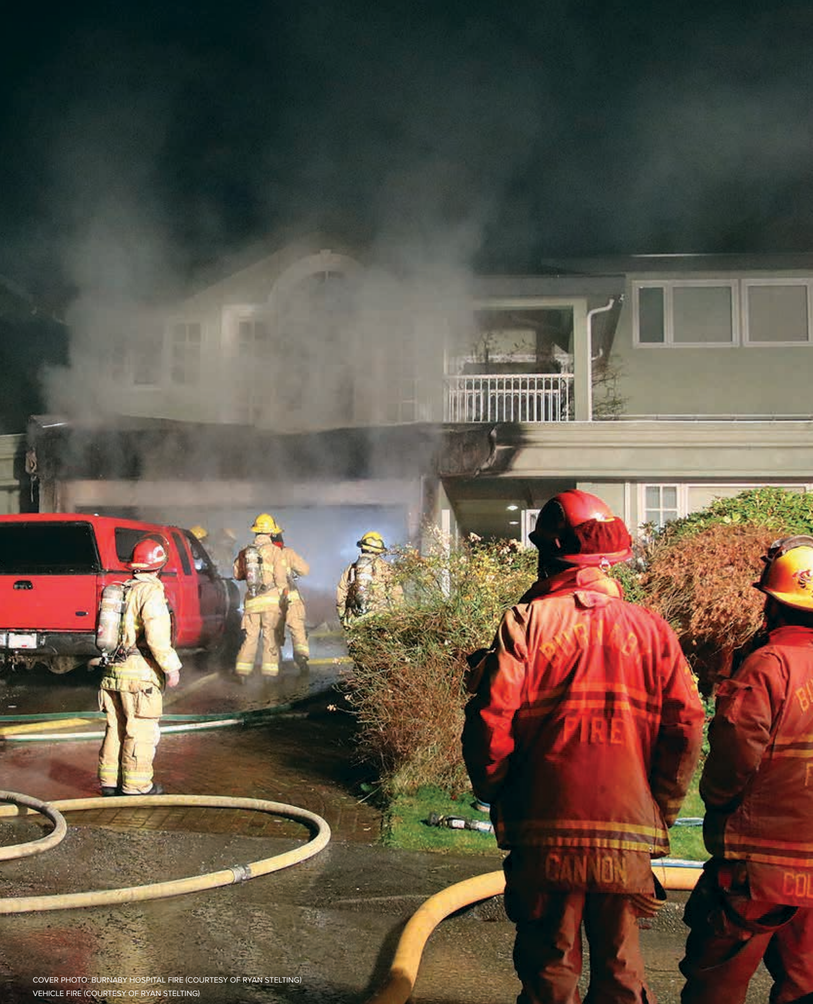
COVER PHOTO: BURNABY HOSPITAL FIRE (COURTESY OF RYAN STELTING) VEHICLE FIRE (COURTESY OF RYAN STELTING)