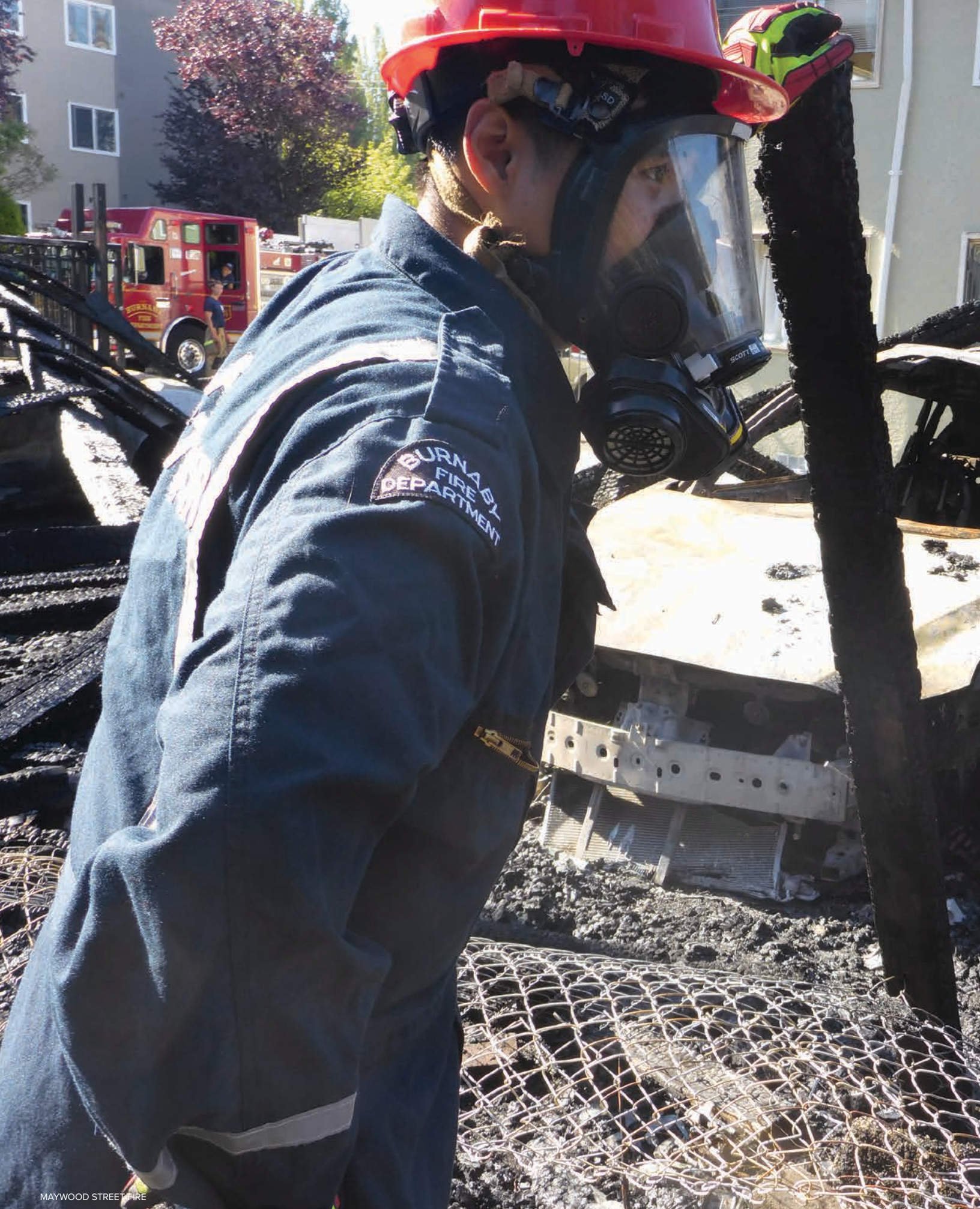
MAYWOOD STREET FIRE