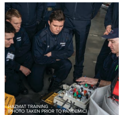
HAZMAT TRAINING (PHOTO TAKEN PRIOR TO PANDEMIC)