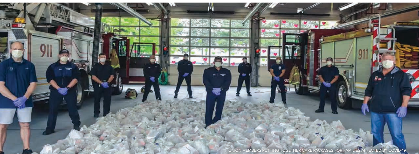
UNION MEMBERS PUTTING TOGETHER CARE PACKAGES FOR FAMILIES AFFECTED BY COVID-19