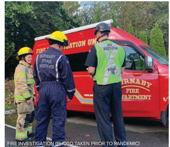
FIRE INVESTIGATION (PHOTO TAKEN PRIOR TO PANDEMIC)