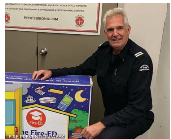
FIRE PREVENTION WEEK