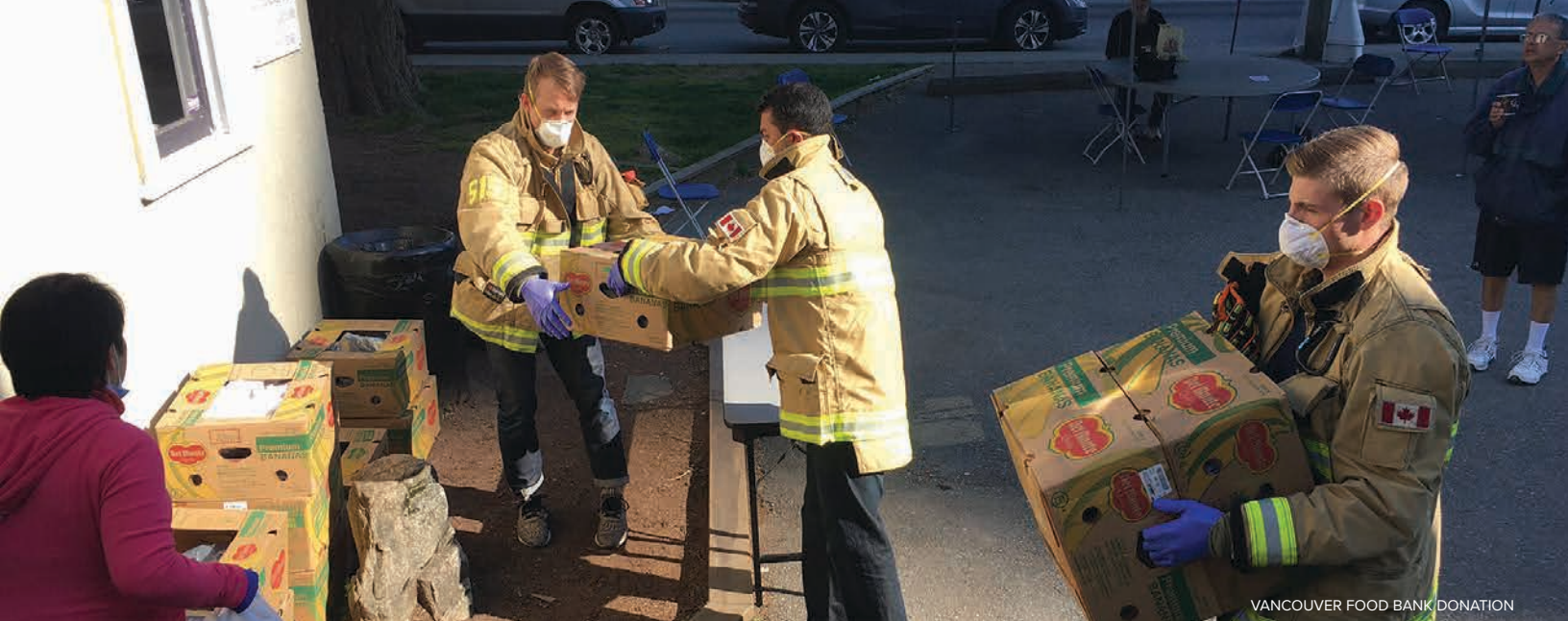
VANCOUVER FOOD BANK DONATION