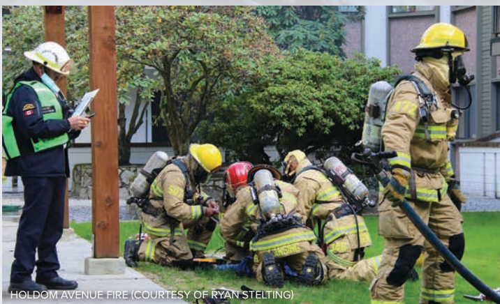
HOLDOM AVENUE FIRE