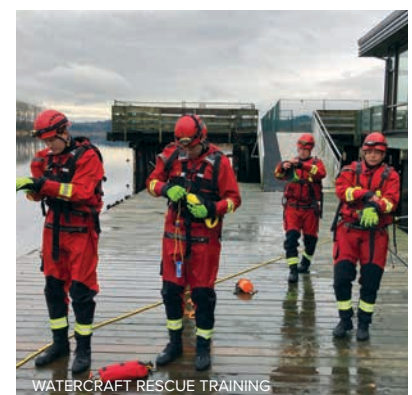
WATERCRAFT RESCUE TRAINING