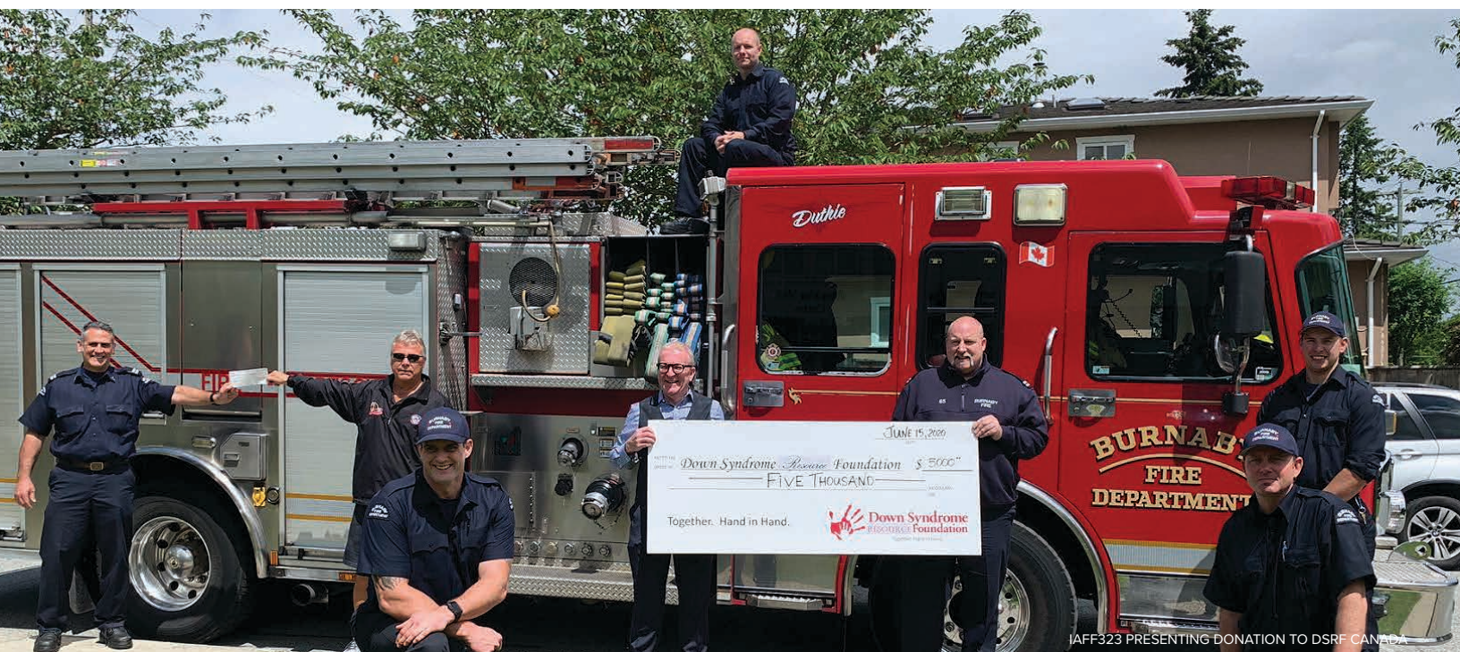
IAFF323 PRESENTING DONATION TO DSRF CANADA