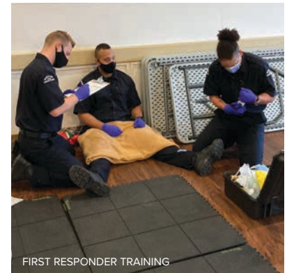
FIRST RESPONDER TRAINING