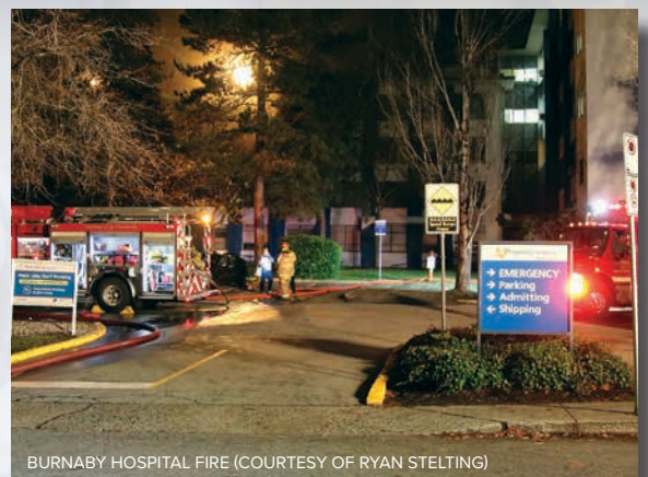
BURNABY HOSPITAL FIRE