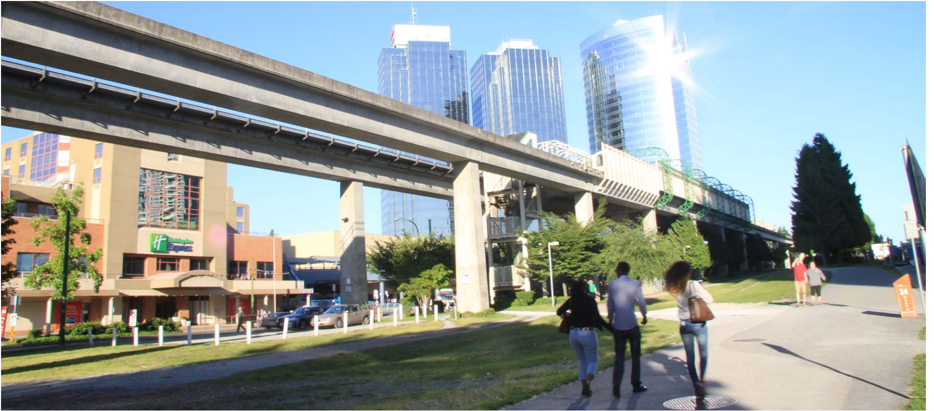
Burnaby's Transportation Plan is intended to make the city's transportation system safer, more sustainable and reduce overall congestion.