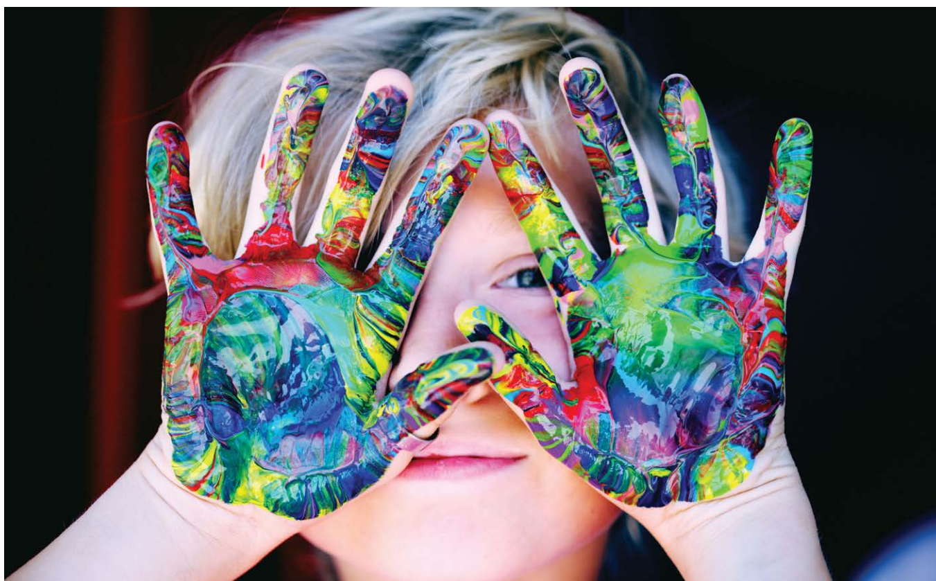
New, affordable child care centres are opening in neighbourhoods across Burnaby, thanks to the City's partnership with the School District.