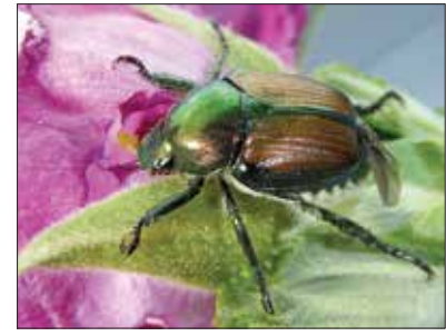
Dave Holden (CFIA)

To apply for a Movement Certificate or find out more about movement controls: Call: 604-292-5742 Email: BCPF.Japanese.beetle@inspection.gc.ca Visit: inspection.canada.ca/jb