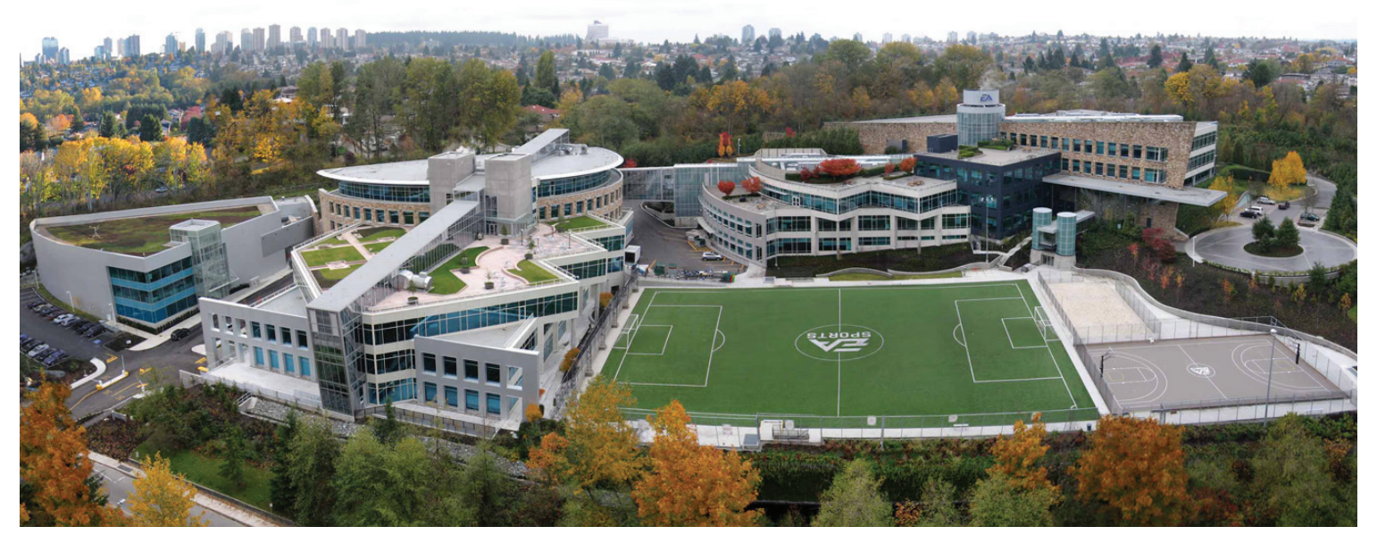
Aerial view of the Burnaby campus of Electronic Arts.