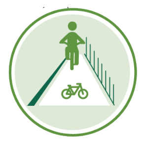
Increased Safety Due to Separation of Users (52 Comments)