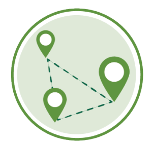
Greater Network Connections (16 Comments)