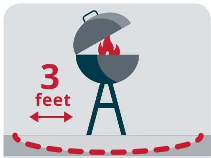
Keep a 3-foot safe zone around your grill. This will keep kids and pets safe.