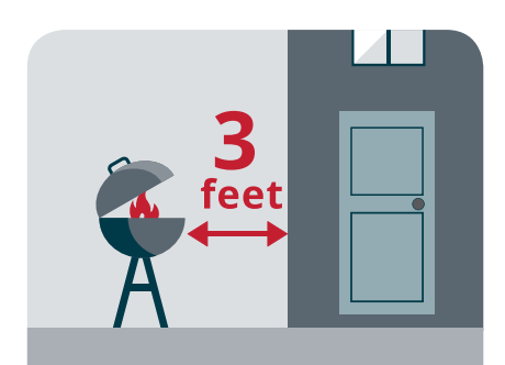
Only use your grill outside. Keep it at least 3 feet from siding, deck rails and eaves.