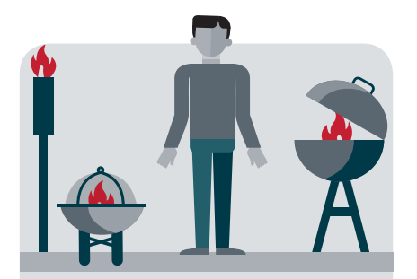
Keep an eye on your grill, fire pit or patio torches. Don't walk away from them when they are lit.