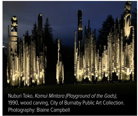
Nuburi Toko, Kamui Mintara (Playground of the Gods) , 1990, wood carving, City of Burnaby Public Art Collection.

With the support of Facilities Management, in 2024 we welcomed new dazzling nighttime lighting to illuminate the iconic and unique Kamui Mintara (Playground of the Gods) during the annual holiday lighting displays. This work was created by celebrated Ainu carvers Nuburi Toko and Shusei Toko in 1990 in celebration of the sister City relationship between Kushiro, Japan and Burnaby. The lighting was prominently located at the Burnaby Mountain Park from November 2024 to January 2025.