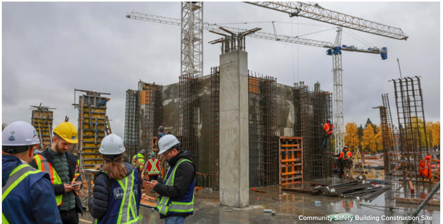
Community Safety Building Construction Site